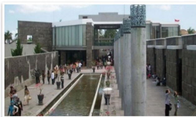
Figure 2. Bung Karno Library as a Public Space Area

Promotion through digital libraries has also proven effective in realizing libraries as public spaces for society.