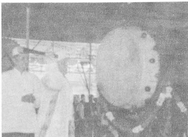
The opening of Wali Songo Festival by B.J. Habibie, then the President of Indonesia.

Indonesia as to how and when this came about. Written sources are of little help in arriving at a definite answer.