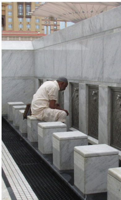
Figure 2. A convenient ablution space in Masjid Nabawi, Madinah.

It is imperative to question the rationale behind the longstanding adoption of the pool structure in mosque design and its evolution into a cultural norm. This architectural convention has persisted over the years primarily because Fiqh, in its traditional interpretation,