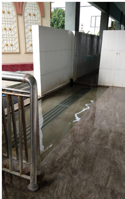
Figure 1. A separating pool in a mosque's toilet in Indonesia.

Now, where does this conventional approach falter? The problem lies in its assumption of an inherent “normality,” as it tends to disregard the presence of individuals within the congregation who may be put at risk or significantly hindered by the presence of this intervening pool. For instance, the elderly, already challenged by mobility constraints, face an increased risk of slipping while navigating this space. Visually impaired individuals will also encounter significant obstacles to their mobility, and those who rely on wheelchairs may find it impossible to traverse this pool. This example underscores the critical importance of reevaluating such “architectural norms” to ensure that the sanctity and accessibility of religious spaces are extended to all community members, regardless of their physical abilities.