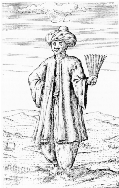
Figure 2. Persian jeweler in Banten, Java, in 1596 (Lodewicksz 1598)

believe them to be Persians.” But, he adds further, they are actually Rajputs (Cortemunde 1953, 138).