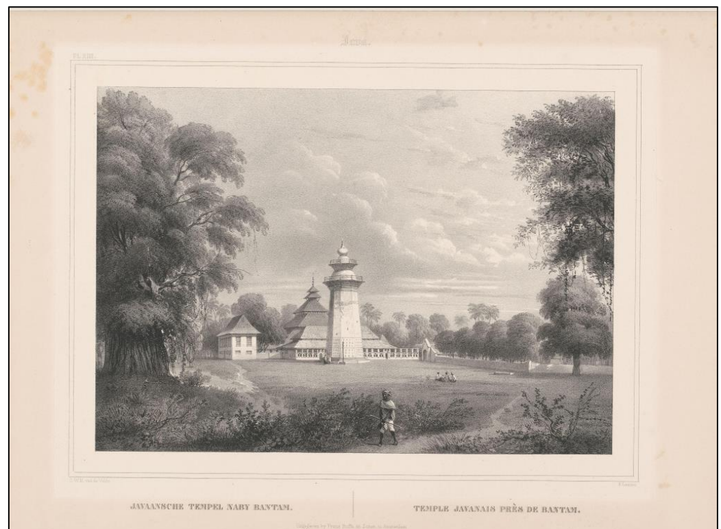
Figure 2. Mosque of Bantam in 1843-1845 in the digital collection of the Rijksmuseum

collection results will appear that can be accessed. However, this does not mean that all the results are 'definitely' directly related to the historical sources. Academics and historians must conduct detailed searches and studies to ensure that the historical sources are appropriate. The research on Banten history through the digital collection of the Rijksmuseum presents various collections that historical researchers can access. The digital collections obtained are the oldest, from the late 16th and early 17th centuries. From figure 1, researchers can use a sketch of the Banten landscape from the perspective of the Banten Strait, where Dutch ships are preparing to anchor in the bustling Banten harbour and reach international networks. In the figure, the researcher can also see the meeting of people near market conditions in Banten, which was bustling with visitors both from the archipelago and from the international world who presented various kinds of commodities and, on the other hand, recorded various other activities in Banten at the end of the 16th century. Figure 2 shows the mosque of Bantam in 1843-1845 in the digital collection of Rijksmuseum.