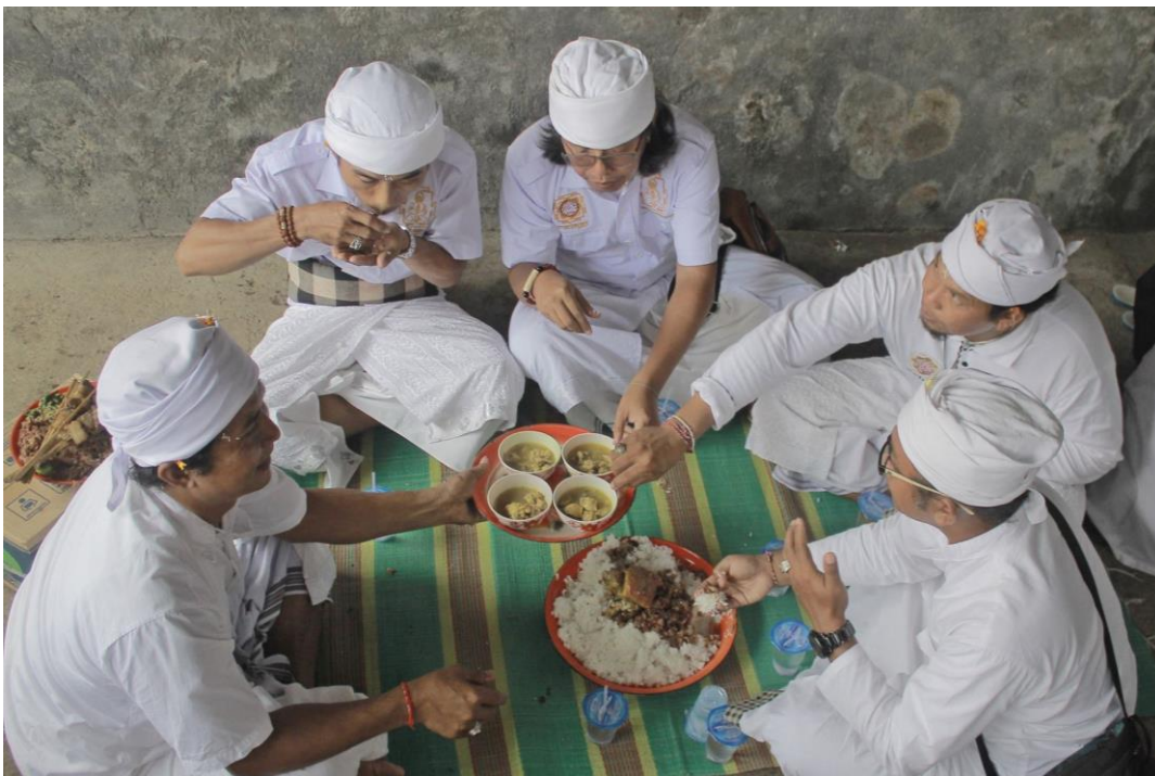
Figure 3. Magibung

Conversely, the lower the appreciation of the community, the more difficult the effort to preserve the culture. Thus, the most important effort in the preservation of a culture is to increase the appreciation of the community for culture and this is certainly a pretty heavy effort is carried out individually. However, if efforts to raise culture are carried out jointly and in a coordinated way, it is not impossible that efforts to preserve various cultures will not meet any significant obstacles. Likewise in social life, the Hindu community prioritizes togetherness such as magibung which is held by the family by involving all adolescents to adulthood, so that it can become an activity that educates the community directly about actions that are social education, arts, and culture, ethics and moral discipline. in life so that it can lead to an improvement in life.