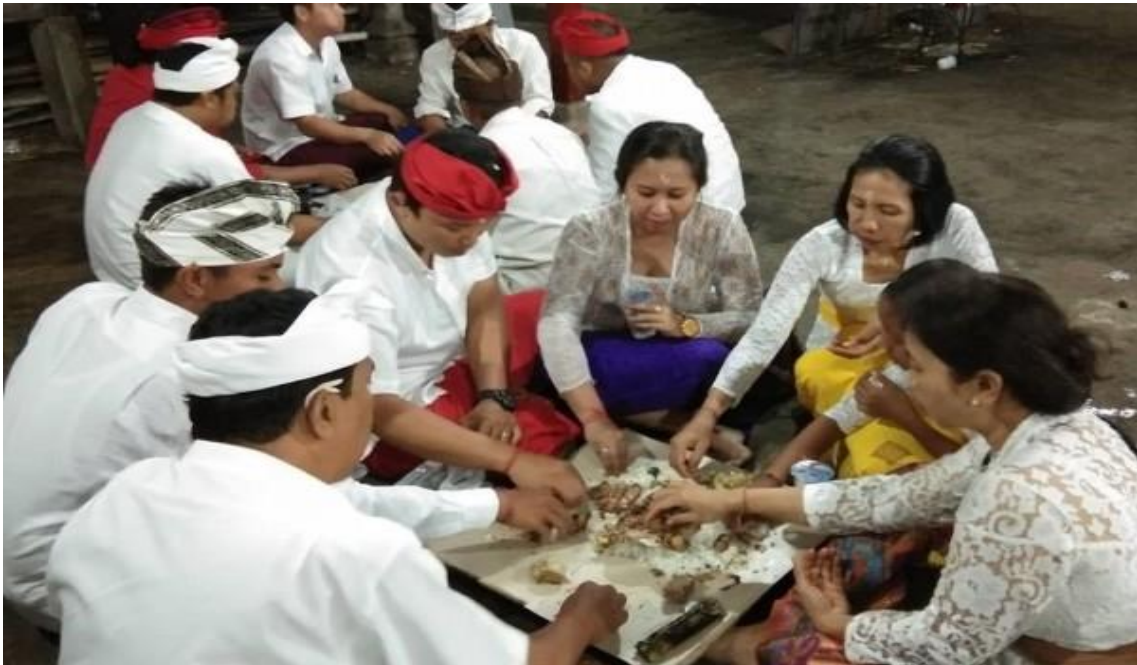
Figure 1. The procedures for magibung in Karangasem

Magibung is an activity of eating out together that involves many people and is related to traditional ceremonies in the community. Magibung has prominent characteristics such as religious, aesthetic, solidarity, sense of belonging, cooperation based on " tat twam asi " or humanity 16 . According to the Balinese-Indonesian dictionary, magibung is the activity of eating out together in a dish (rice and side dishes in one place). Gibungan is a meal or food that is eaten by eight people together by sitting in a circle 17 (Kersten SVD, 1984).