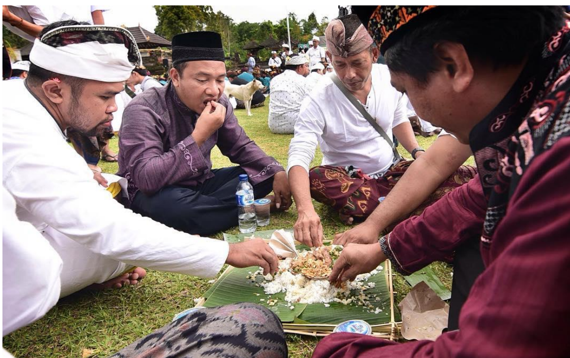
Figure 2. Magibung : Synergy 'Caring for Grassroots' in Kinship Circle

Magibung is the actualization of culture and customs manifested concretely in the norm. Magibung is a community tradition that is preserved and passed on from the older generation to the younger generation. In the process, magibung changes. The development of magibung as a culture has never been avoided from contact with other cultures. "Through the development of global communication, interculturality has now become a limit. As a result, the orientation of customs and traditions to act singly from the original tradition, culture also undergoes a process of division into sub-variations" 18 .