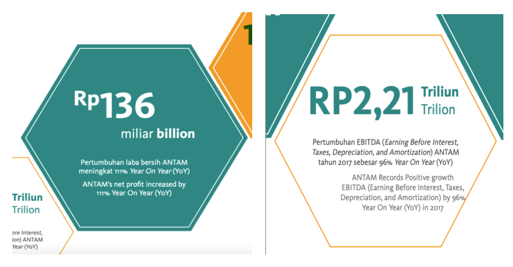
Figure 3 The Growth of PT. Antam Tbk