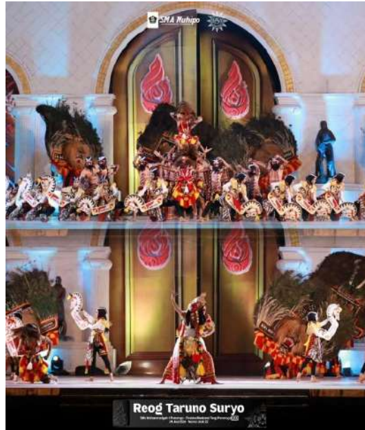
Figure 1. Visualization of Warok and Jathil in the Reog performance

(horse dance) wrapped around the hips and back. Furthermore, the dancers' slender bodies, clad in bright batik and metal accessories, accentuate their lively, energetic expressions. These facial expressions semiotically represent the strong feminine energy within the visual composition of the Reog performance as a collective cultural identity.