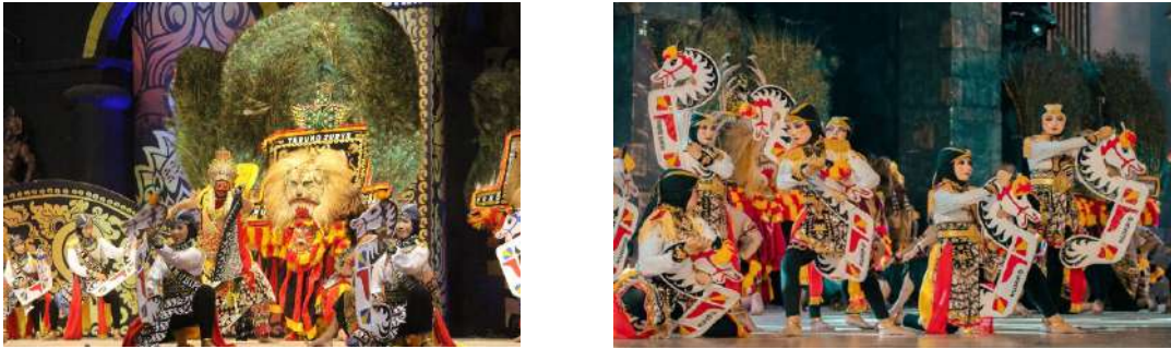
Figure 4. Appearance of the reog art “Taruno Suryo” at the 2025 Ponorogo National Reog Festival