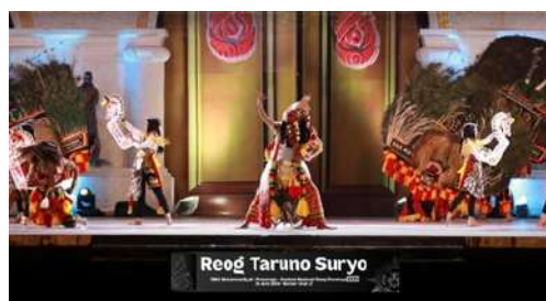
Figure 2. Visualization of Pembarong and King Klono Sewandono in Reog art

Third, a pembarong , or singo barong , is a performer wearing a giant reog mask and a barongan costume. Those masks or costumes symbolize strength and the spirit of resistance against all forms of evil. Visually, the barong figure dominates the stage, towering over the stage with a carved wooden mask, a jet-black costume of thick wool, and iron claws that scratch the ground. The primal expression behind the mask can represent primal energy as an unrivaled protector. Fourth, King Klana Sewandono is an antagonist in the reog story. The figure of Klono Sewandono is known as a gallant king, with a red face and glaring eyes, and he carries the Samandiman whip. Visually, he appears to be wearing a wooden mask with a fiery red face, which can symbolize anger and power.