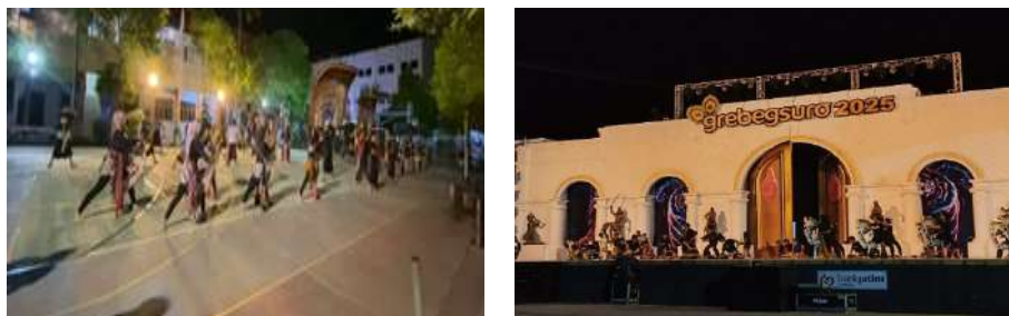
Figure 3. Documentation of practice before appearing at the Ponorogo National Reog Festival 2025

The training activities intensified when the “Taruno Suryo” reog arts community actively performed at the 2025 Ponorogo National Reog Festival.