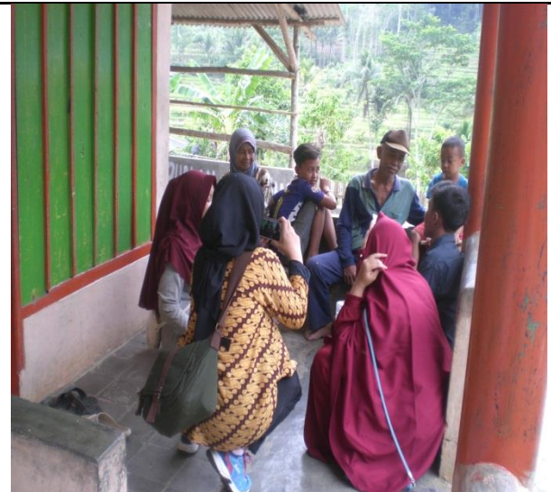
A. In depth interview process