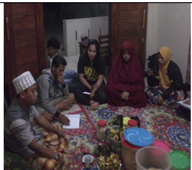
B. Sharing of knowledge or discuss about