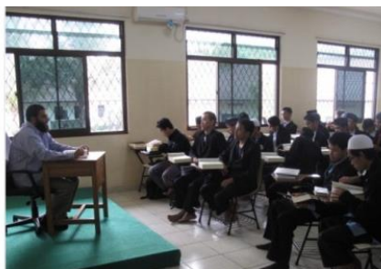
Figure 2. Implementation Discussion Class

Based on this statement, discussion and practice are the strategies in learning speaking skills. This is in accordance with the statement that language is a habit of exchanging information. 26 The discussion activities between teachers and students can be illustrated by the following figure.