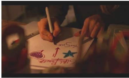
Screenshot 1 (00:26:46)

Moxie represented feminist movement through Vivian's attempt to influence her friends' point of view as her point of view as a feminist. This action undoubtedly created a major change in the term of students' awareness regarding patriarchy and feminism. For instance, when Kaitlynn was sent home by the principal because she wore a tank top in school, Vivian immediately made another magazine and wrote "Hey moxie girls, have you had enough of these ridiculous, sexist dress code checks? they're arbitrary and focus overwhelmingly on girls over boys. Operating on the idea that girls handle boy's behavior" (00:44:56). Vivian's writing was focus on the unfair rules and treatment that received by female students, and persuaded others to be aware of this as a part of feminism. This can be seen in Screenshot 1 and 2.