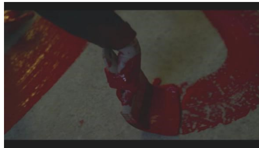
Screenshot 5 (01:35:21)

Another vandalism which was committed by Vivian was her action in writing a big painting says 'Rapeport' in the school terrace by using red paint. She did this to support a rape victim which confessed it to 'Moxie' through an anonymous letter. After a lot of efforts in spreading feminism awareness and a lot of trying to destroy patriarchal system in her school, she seemed furious because what 'Moxie' had done so far did not bring up any result. Male domination, glorification, superior, and power over female still existed and difficult to be ruined.