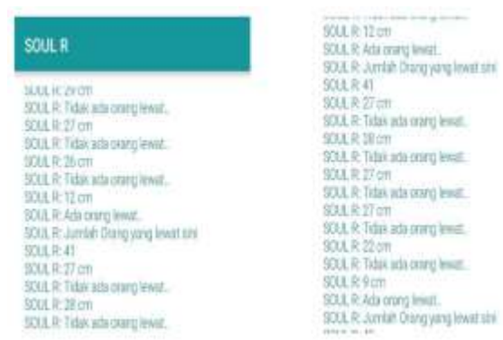
Figure. 3 Bluetooth Output on Android