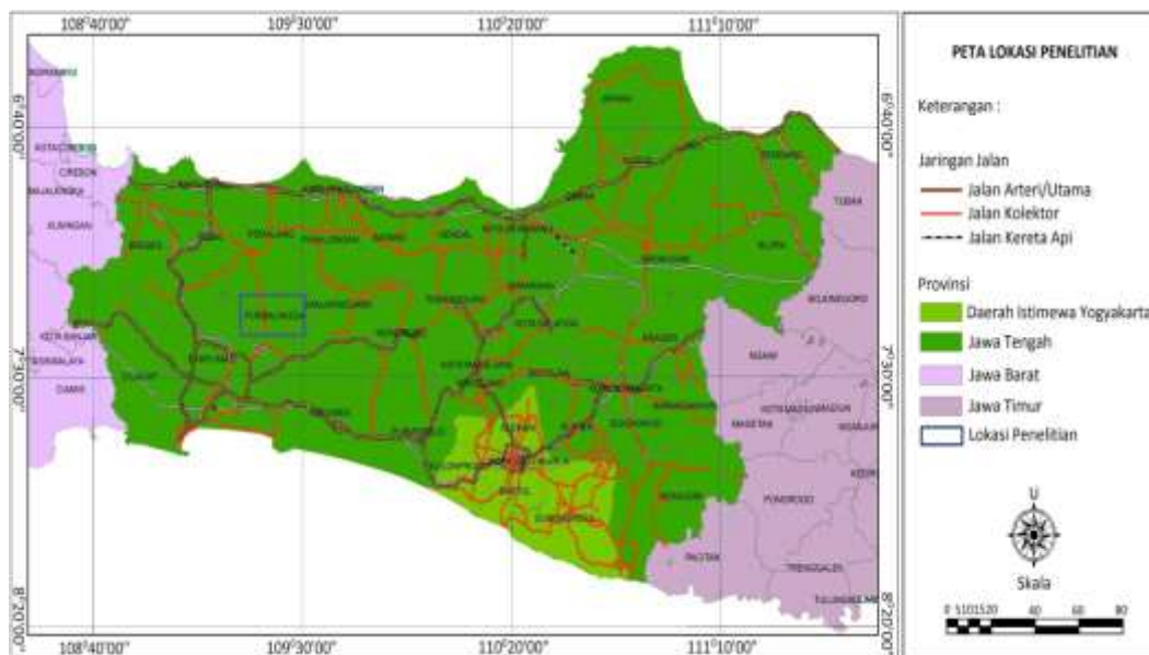
Figure 1. Location Map of Research Areas

Purbalingga Regency has quite a large amount of andesite, sirtu and tras Digging Materials, located in Karangrejo District, Bobotsari District, Mrebet District, Bojongsari District and Kutasari District. The surrounding community has been mining the materials with simple equipment. In uncertain economic conditions, it turns out that andesite, sirtu and tras Digging Materials are very promising for local and regional development needs, as many people apply for licenses and there is mining without permits, supervision of the community or investors who will conduct mining in Purbalingga Regency is needed.