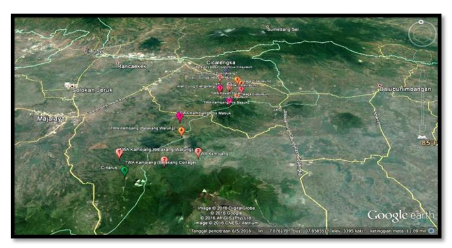
Figure 2. Distribution of surili in Kamojang Area

The distribution of an animal can be affected bv several factors, geographic primates highly dependent on ecological adaptation to the habitat, such as the state's population density, wide area of their home range at each group, food availability, predators and others. Suitable habitats are habitats that provide all the habitat requirements for a species for a particular season or year. The habitat requirements consist of feed, crown cover, and other factors needed by survivors to survive and for the success of the reproductive process (Bailey, 1984 in Sari, 2010). That applies also to the group surili contained in the NR and NP of Kamojang, with the discovery of the spread surili at some point in the region.