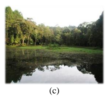
Figure 1. The area of observation. (a) block Kawah Kamojang, (b) block Ciharus, (c) block Cibeureum